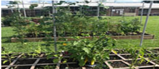
Progress with the Garden Crew!

In March, the Garden crew began planting. Mark Godeau, an instructor at LARC, and eight consumers in the Garden Crew have been working hard to maintain and harvest from the gardens. They inspect and work in the garden daily.